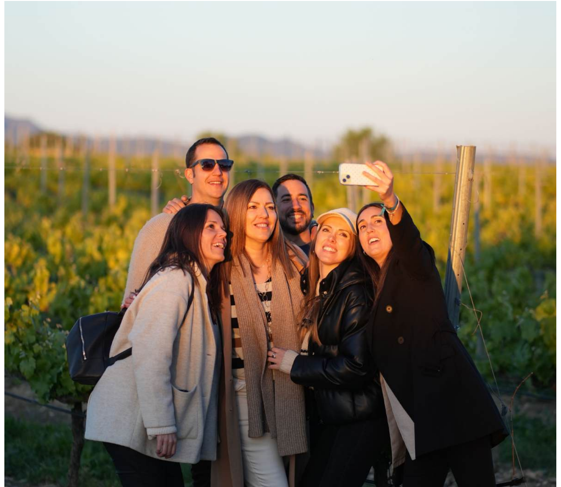
A group of people take a photo in a vineyard