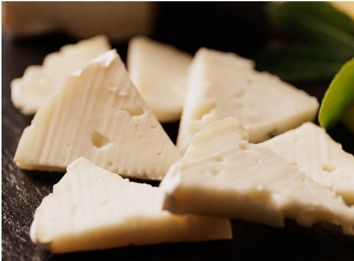
Pieces of cheese on a table