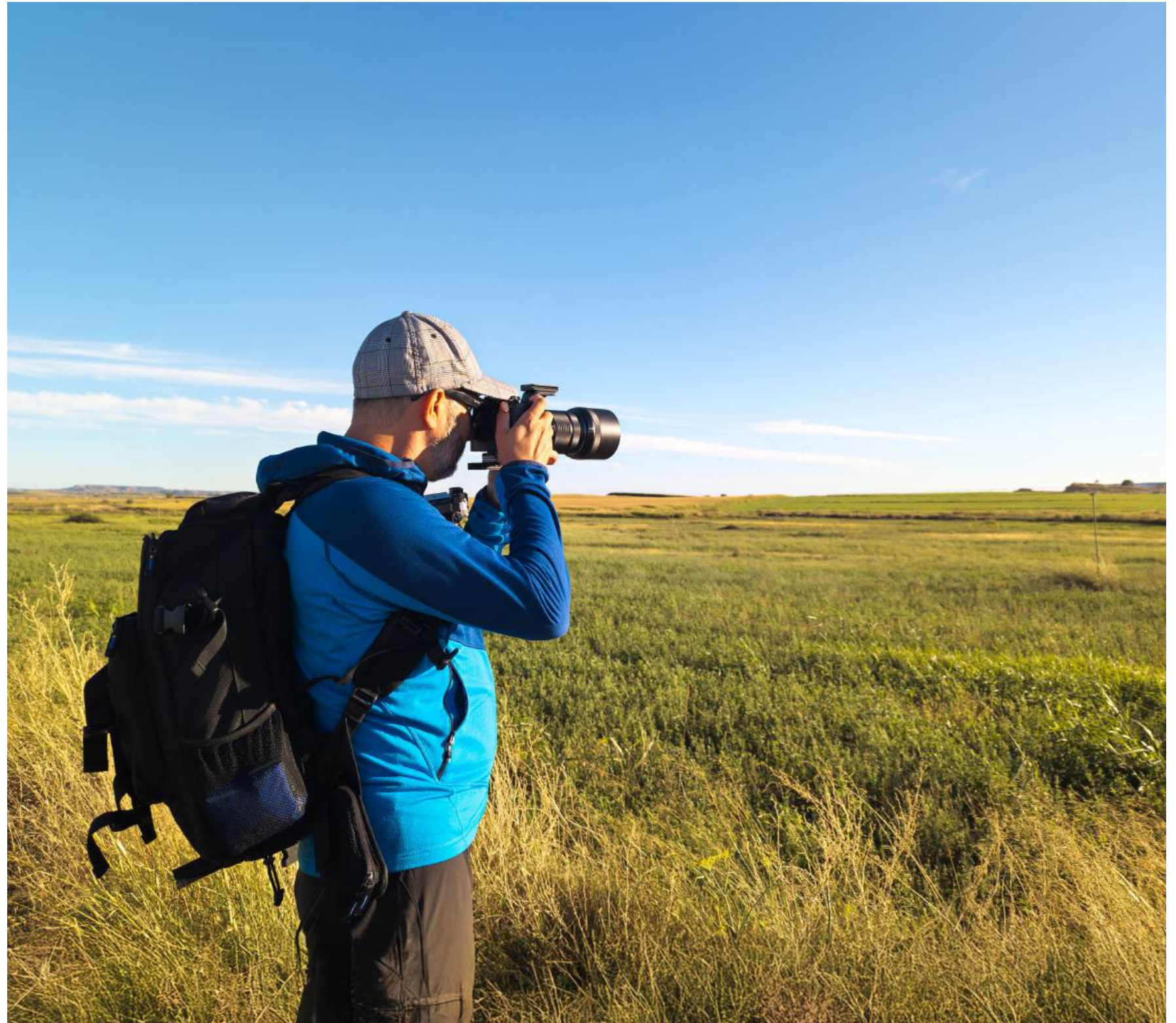
A person watches birds with a camera