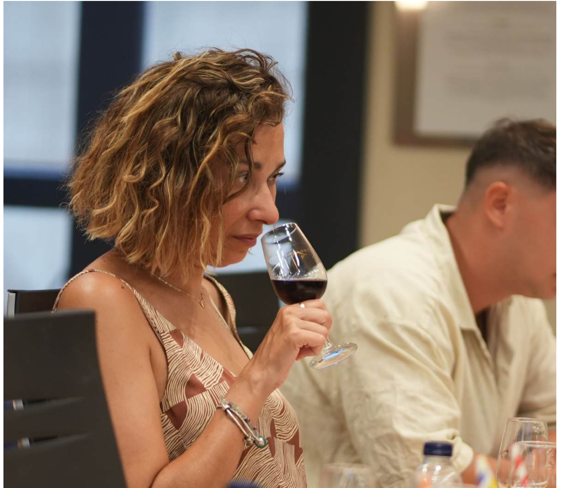
A woman smells wine from a glass