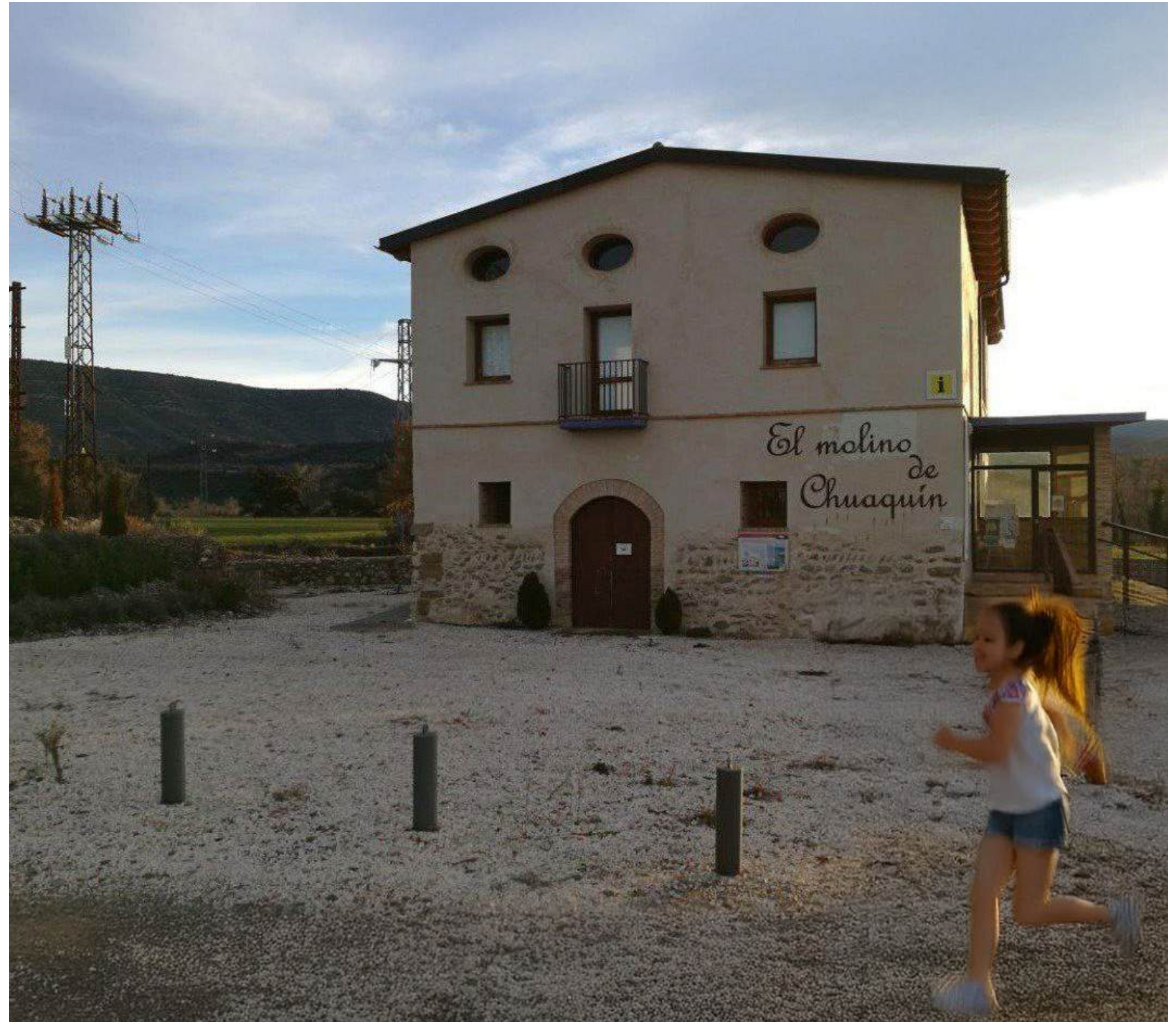
A girl runs near an old mill