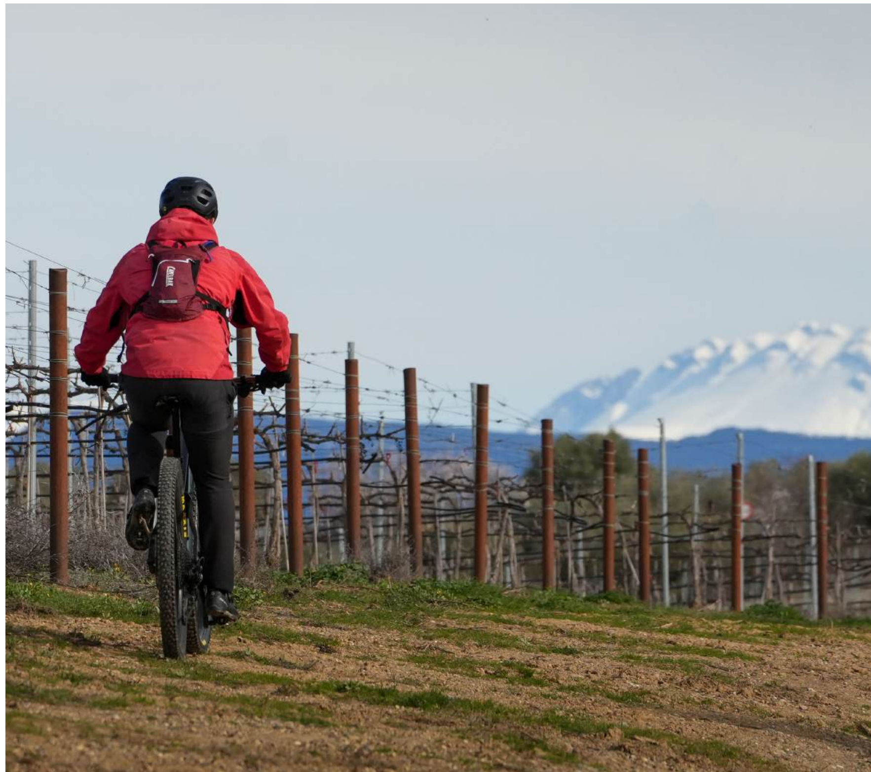
A person rides a bicycle through vineyards