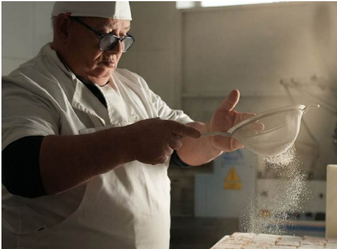
A person prepares a dessert