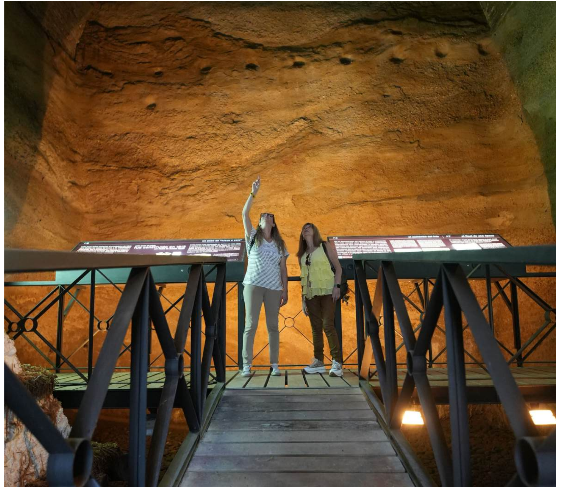
Two people visit an old place and look around