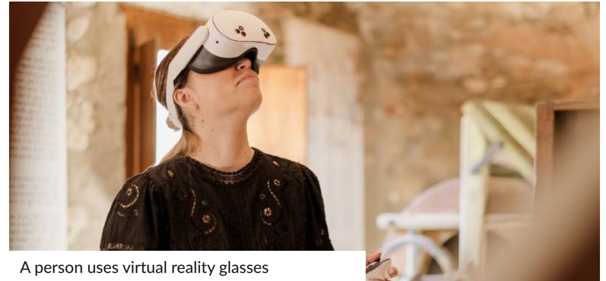
A person uses virtual reality glasses