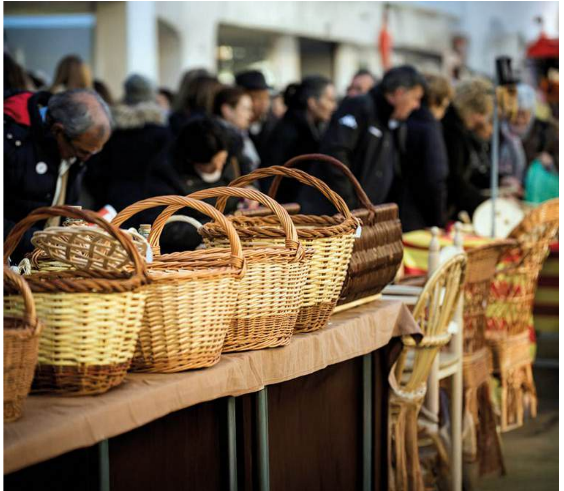
Handmade baskets at a busy market