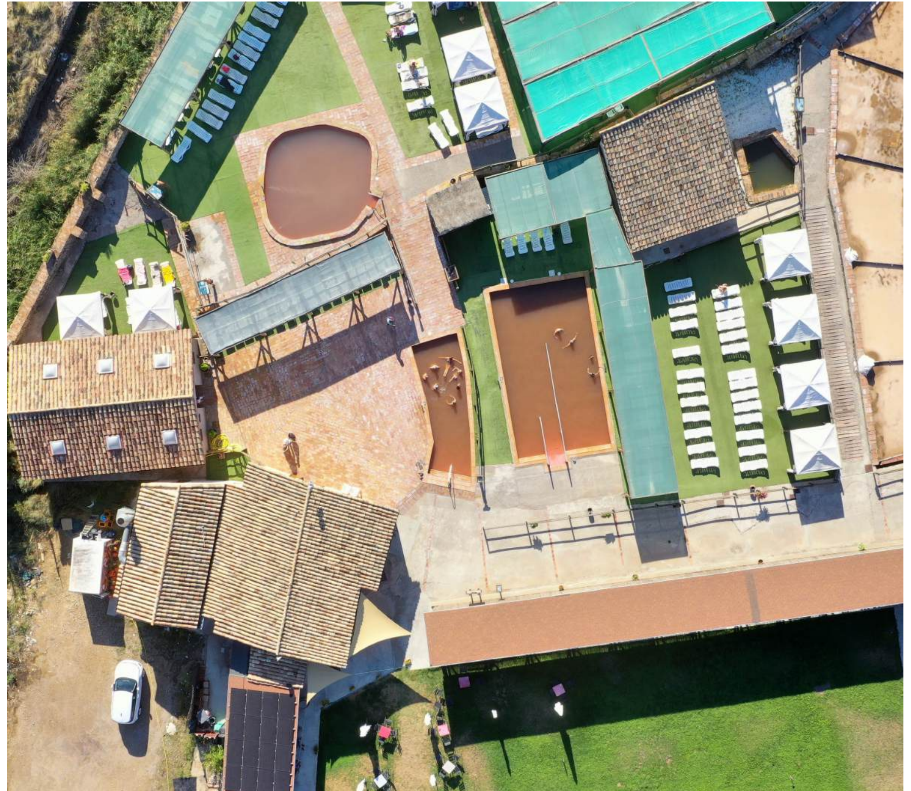
People swim in salt-water pools