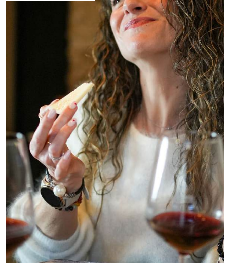
A person tastes cheese