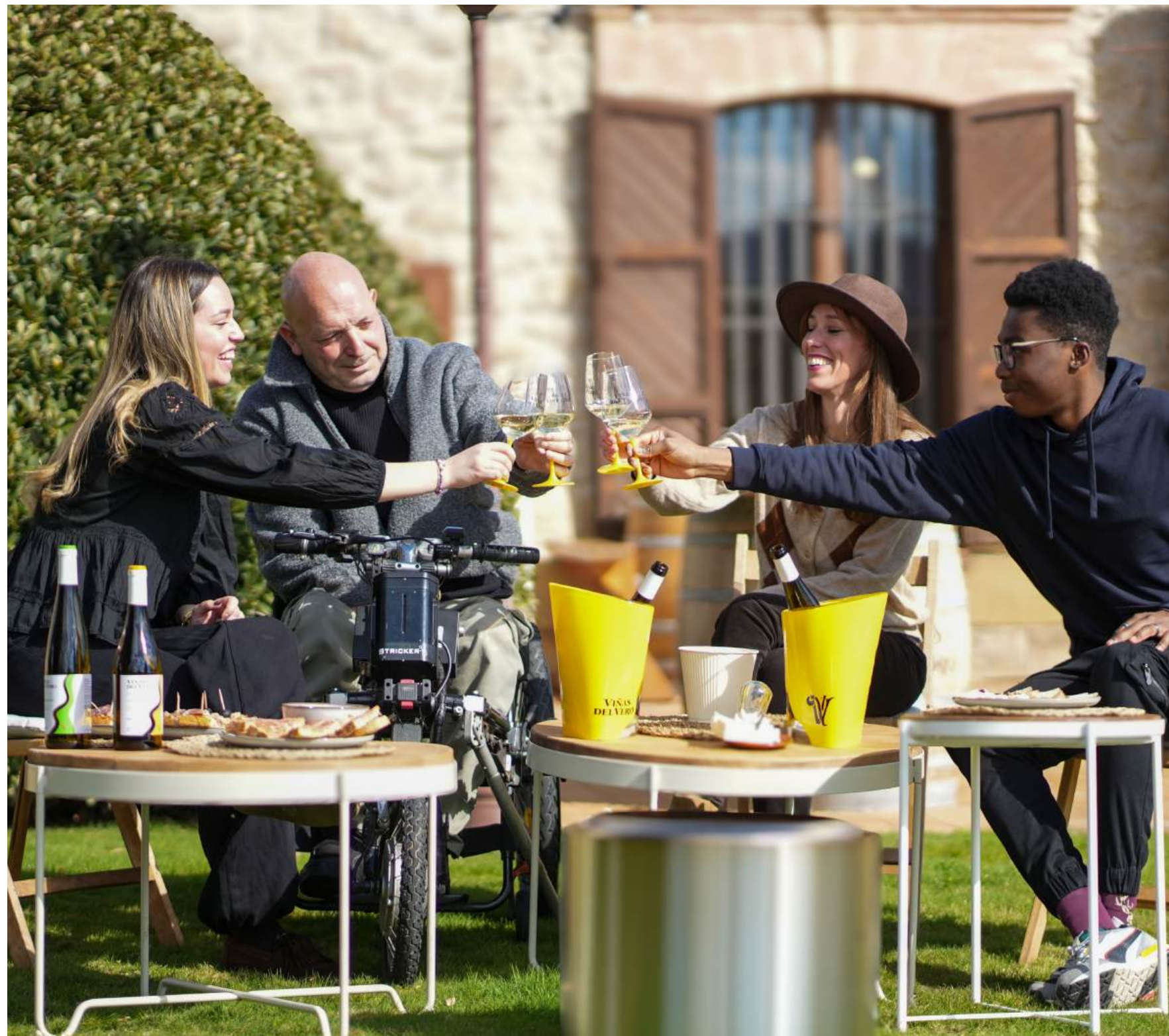
People toast with wine