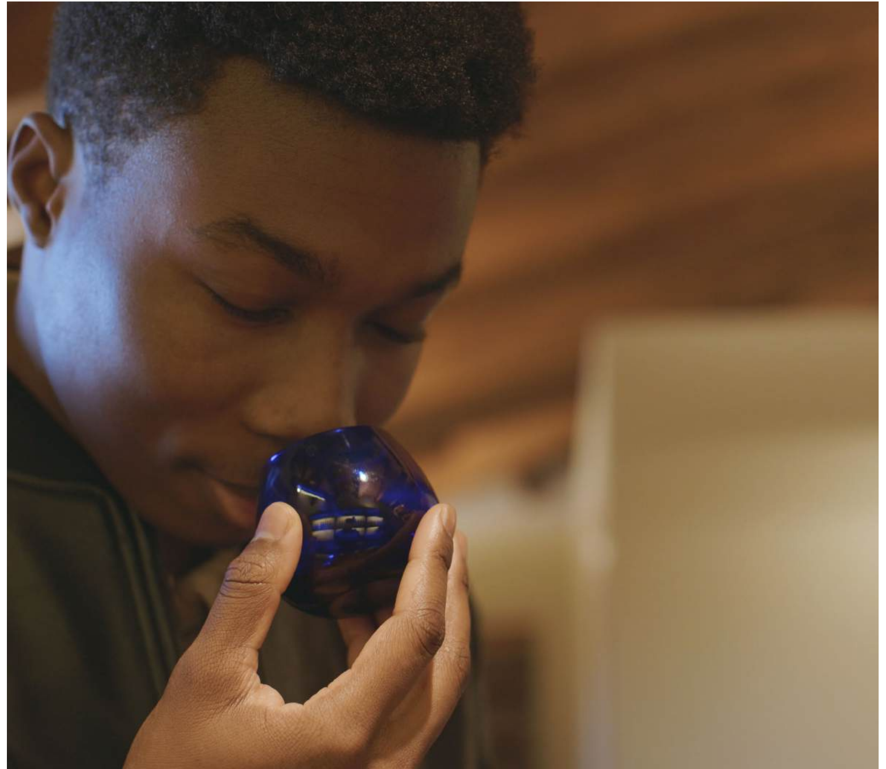
A person smells olive oil from a tasting glass