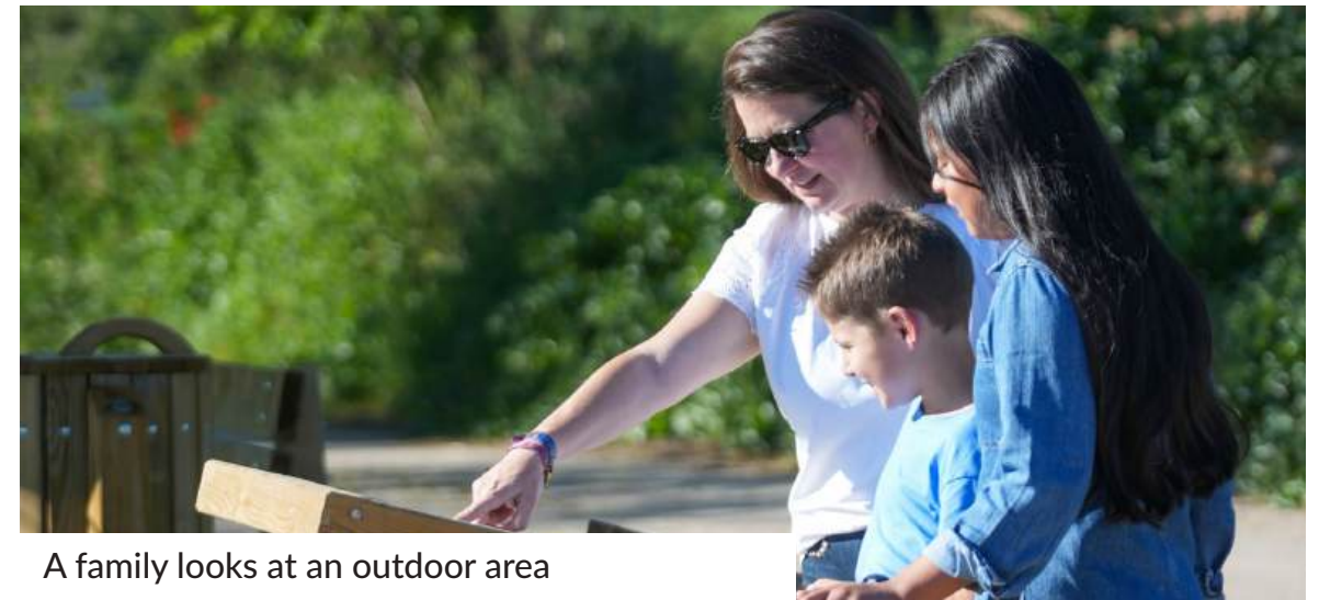
A family looks at an outdoor area