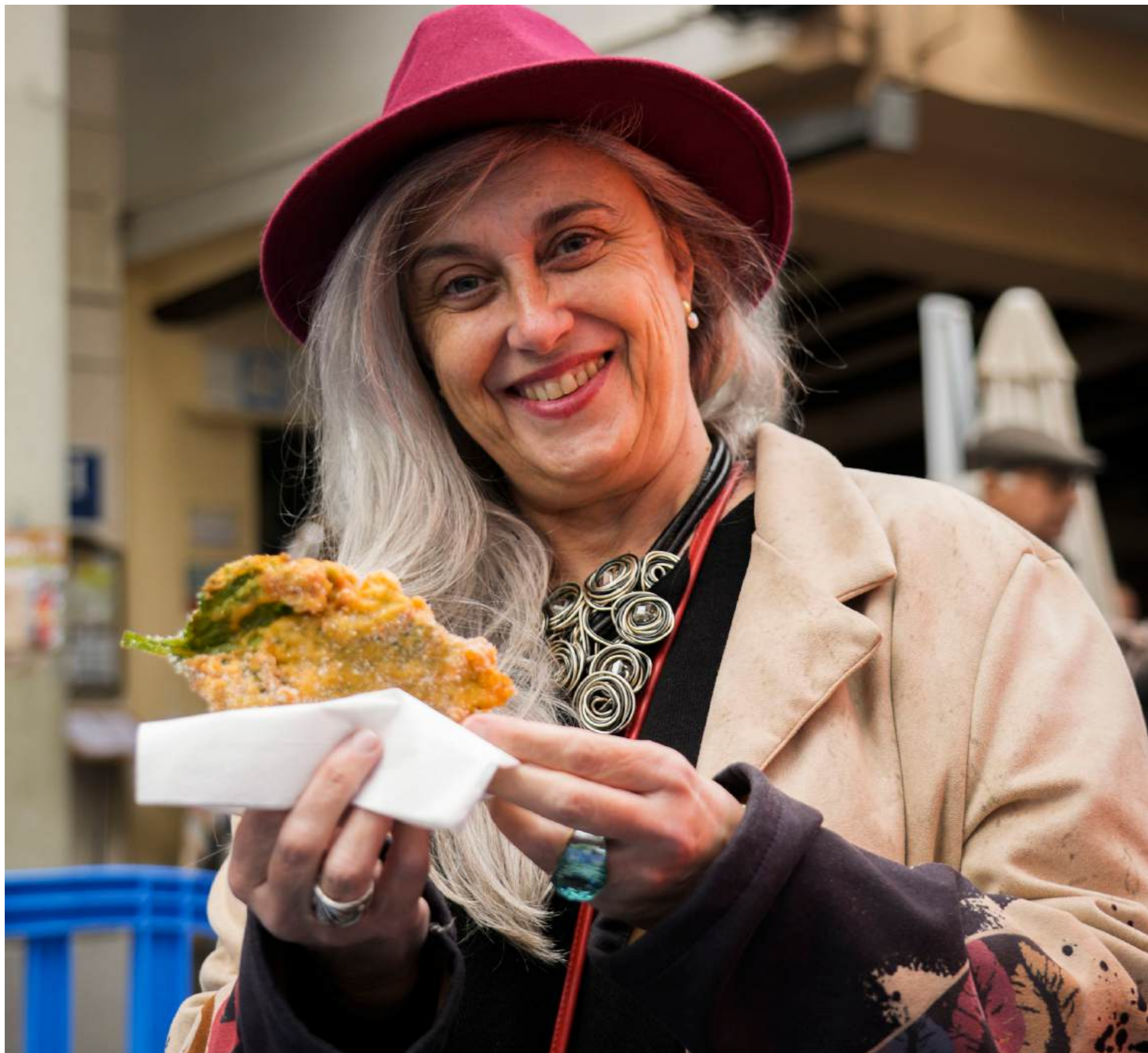
A person smiles while showing a crespillo